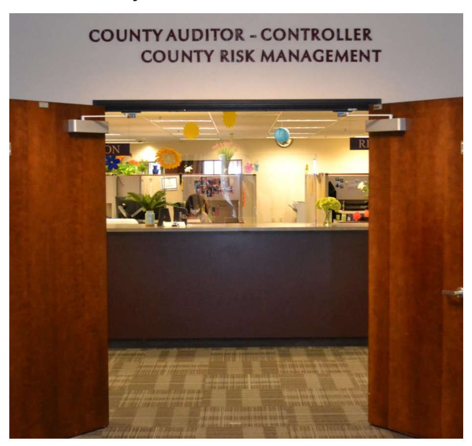
Participation in the Annual Financial Audit Report For the Fiscal Year Ending June 30, 2020